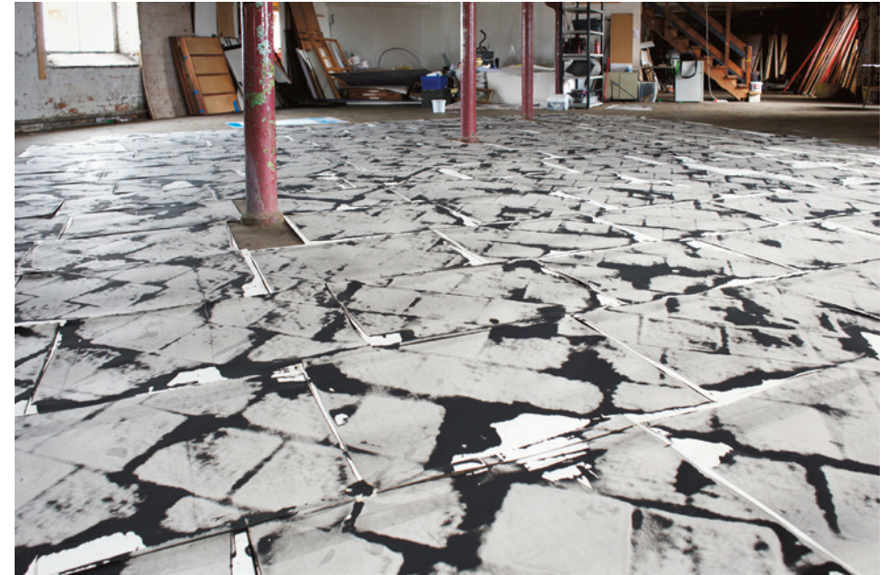
Islington Mill's 5th floor Test piece for single colour monoprint series

'Performance Publishing' references ancient Chinese printing techniques, which reproduced the imprint of stone inscriptions, allowing information to be duplicated and distributed – the first known form of publishing. By 'publishing' the stone flags of the Mill's floor, Maurice's work forms a double 'imprint' that captures both the memory of this creative moment and the physical structure of the Mill itself prior to its radical transformation.