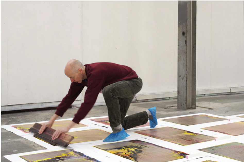
Performance Publishing: Excelsior Works (2015) Performance still