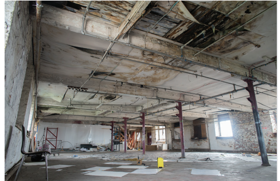
Islington Mill's 5th floor In need of repair, June 2016