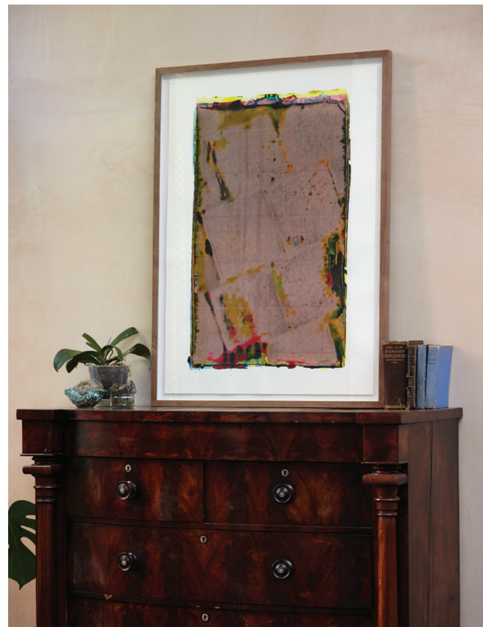
Test pieces for full colour CMYK series

For more information about buying a print and becoming a Temporary Custodian, contact Lucy Lloyd-Ruck on 07789 173796 or email fundraising@islingtonmill.com